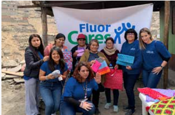
Volunteers partnered with Nexos Comunitarios to celebrate crafts created by micro-business entrepreneurs // Lima, Peru

Fluor's office in Peru, which forms part of our larger Santiago, Chile location, partnered with CARE Peru to support the Women's Leadership Program. This initiative provides training to help women set up their own small businesses. We also help Peruvian artisans learn how to sustainably market their handicrafts online through Nexos Comunitarios' Weaving Ladies of Paradise Association. Through financial donations and mentoring support, Fluor and our employees are helping empower entrepreneurship that can provide a sustainable living for women and their families.