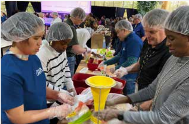
Volunteers worked in teams to pack 51,200 meals in less than one hour // Greenville, South Carolina, United States

Fluor seeks to feed the hungry in our local communities and in areas devastated by war and famine. Globally, we provided 706,000 meals to those in need in 2023, and nearly 2.4 million meals over the past three years, through organizations such as the World Food Programme, Global Food Banking Network, Rise Against Hunger and other relief agencies.