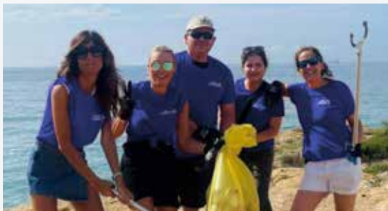
Fluor Cares volunteers participate in beach clean up // Tarragona, Spain

In this edition, you will find a review of our 2023 community engagement results, spotlighting our offices in the United Kingdom, Peru, the Philippines, the United States and India. From fighting hunger and combating climate change to empowering the next generation, these community partnerships are a pivotal part of our Fluor story.