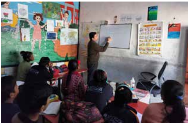
Fluor volunteers teach math to orphans and underserved students at the Dream Girl Foundation // New Delhi, India

On their days off, employees serve the midday meal to children in the program. Beyond providing hot meals, the volunteers also provide mentoring and tutoring. In the last half of 2023 alone, Fluor volunteers tutored approximately 70 students with basic computer skills such as Microsoft Office, Adobe graphics and web design. They also tutor in English, math, science and basic life skills.