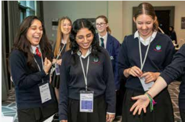
Students from seven local schools participated in the 8th Annual Girls in STEM event // Farnborough, United Kingdom

The event also included keynote speeches from Fluor executives and question and answer sessions. Evaluations from the event were overwhelmingly positive, with students reporting an increased awareness and consideration of future STEM careers.