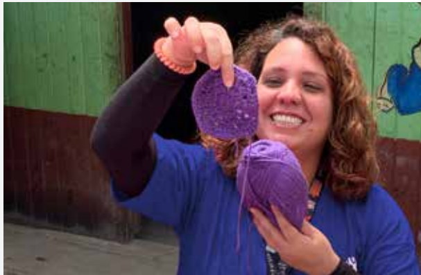
A Fluor volunteer highlights one of the hand-knitted projects created by a local Andean zone artisan // Lima, Peru