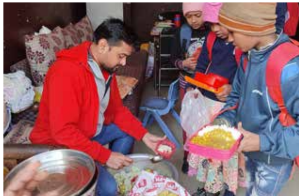
A Fluor employee serves midday meal to children in need // New Delhi, India