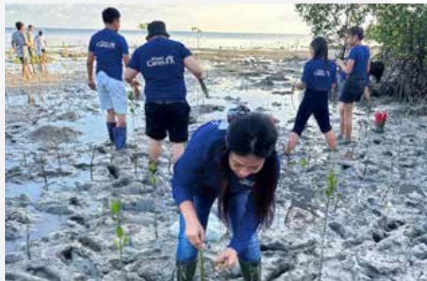
Fluor employees plant mangrove seedlings to restore the coastal ecosystem // Cebu, Philippines

In addition to our work in the Philippines, Fluor and our employee volunteers are supporting large-scale reforestation efforts in China, Poland, Saudi Arabia and the United States.